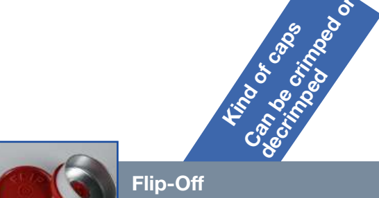
Flip-Off Can be crimped or decrimped*(1)