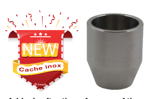
Add «-l» after the reference of the standard cover to benefit from the stainless steel finish